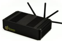
Outdoor Green Box